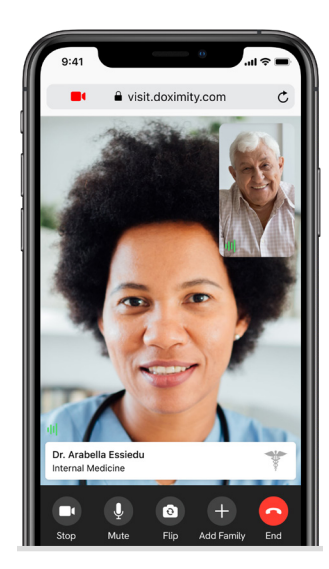
You are now in the video call room and connected with your provider.